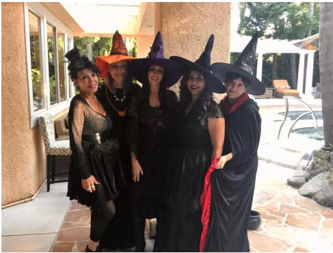
A couple of the Friends of CASA members who helped plan the Witches Tea.

Friends of CASA hosted a Witches Tea recently in Westlake Village. Everyone came outfitted in their favorite witch attire, and several guests went the “extra mile” in creating elaborate witch costumes. It was a fun afternoon of snacking on tasty treats, visiting a tarot card reader and bidding on some fabulous auction items.