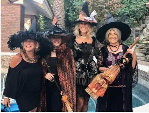
The winners of the Witches Tea costume contest.